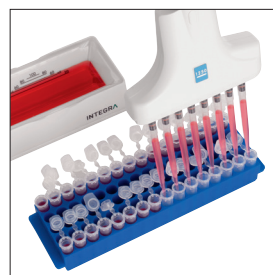
Access to tube racks