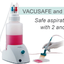
VACUSAFE and VACUBOY

Liquid aspiration, collection, disposal and pump systems