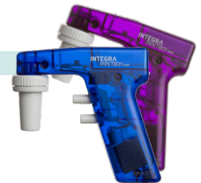
INTEGRA serological pipets

INTEGRA serological pipets are compatible with every pipet controller on the market